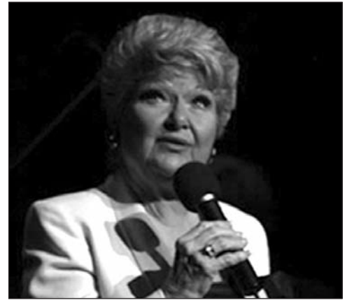
Marilyn Maye will join the Castle Singers of Wartburg College in a concert to benefit MLM May 1.

The cost for The Joy of Singing is $20 per person in advance or $30 at the door. For more information, call MLM at (816) 931-0027 or visit www.mlmkc.org .