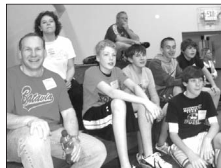
MLM's April 8 Middle School Dodgeball was a big success. Even those in the stands enjoyed the day.

She's optimistic, too. “I made mistakes,” she agreed. “Especially when I was young. I lived life hard. But my mother, the projects, the military and the Lord have taught me discipline. I'll make it.”